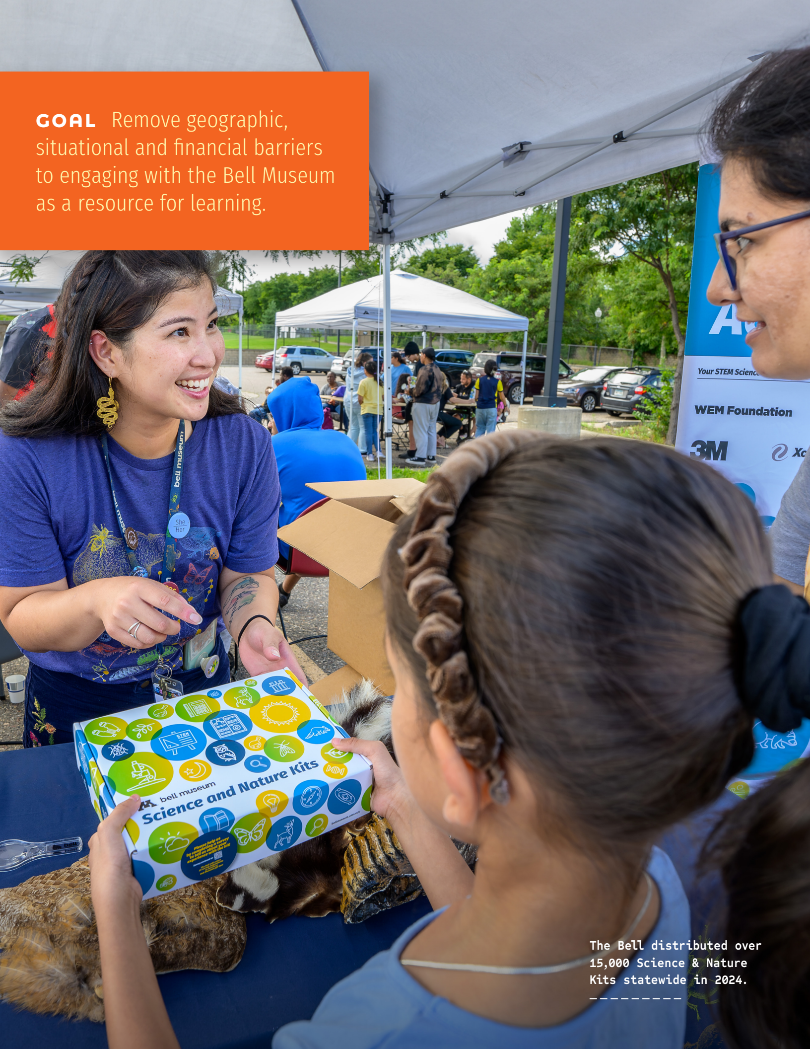
The Bell distributed over 15,000 Science & Nature Kits statewide in 2024.

GOAL Remove geographic, situational and financial barriers to engaging with the Bell Museum as a resource for learning.