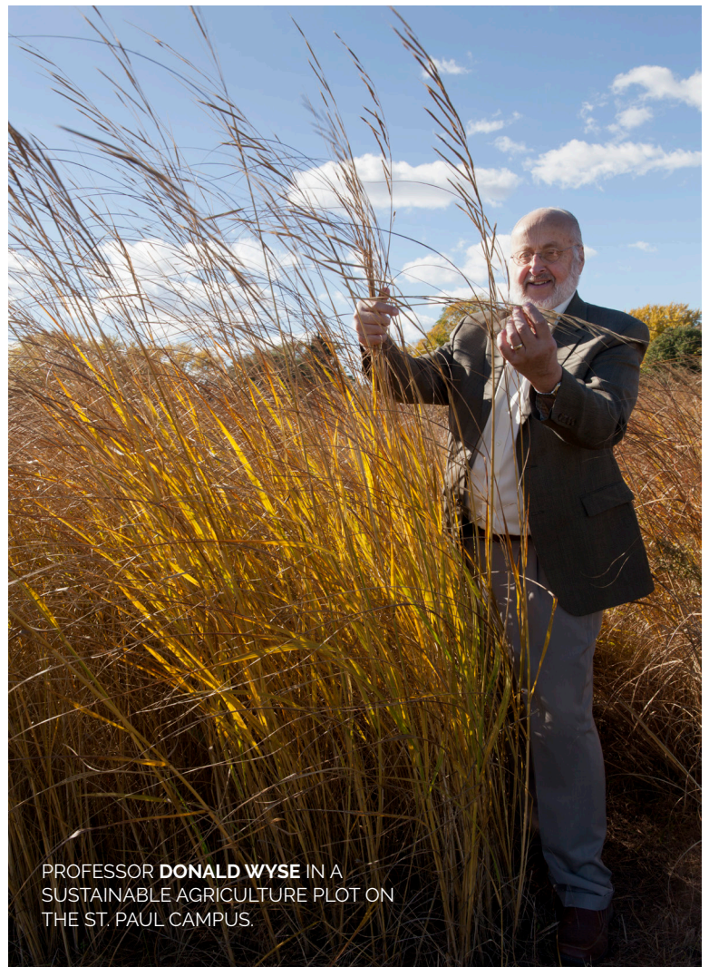
PROFESSOR DONALD WYSE IN A SUSTAINABLE AGRICULTURE PLOT ON THE ST. PAUL CAMPUS.

"When I started my career, quackgrass was the primary deterrent to producing high quality grass seed turf in the region," said Wyse, noting that it also was prohibiting the expansion of new turf species like perennial ryegrass, which today contributes significantly to the region's economy. About 150 growers now produce around 45,000 acres of perennial ryegrass for seed, due primarily to U of M research in partnership with growers and seed processors.