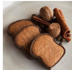
CINNAMON SPICE FLAVORED RETOAST

A team of food science and nutrition students with a passion to eliminate food waste has developed an innovative, award-winning cookie snack called ReToast. Made with 30 percent upcycled ingredients from various food waste products, it