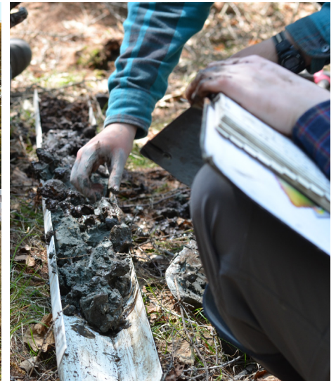
STUDENTS ANALYZE SOIL SPECIMENS DURING A FIELD STUDIES CLASS.