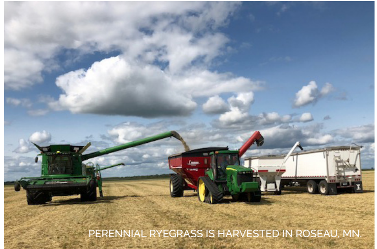
PERENNIAL RYEGRASS IS HARVESTED IN ROSEAU, MN.