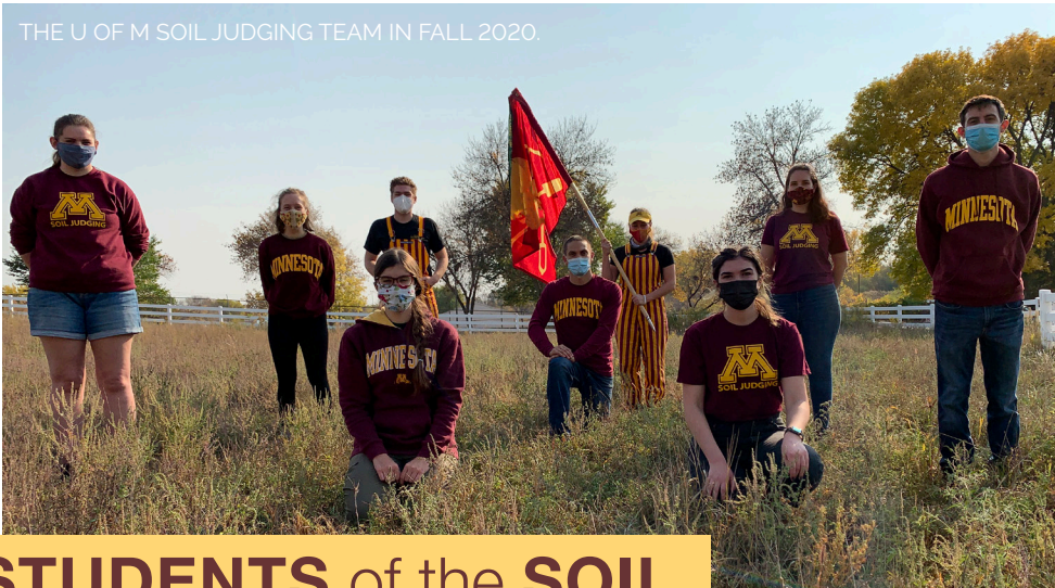
THE U OF M SOIL JUDGING TEAM IN FALL 2020.